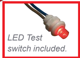
LED Test switch included.